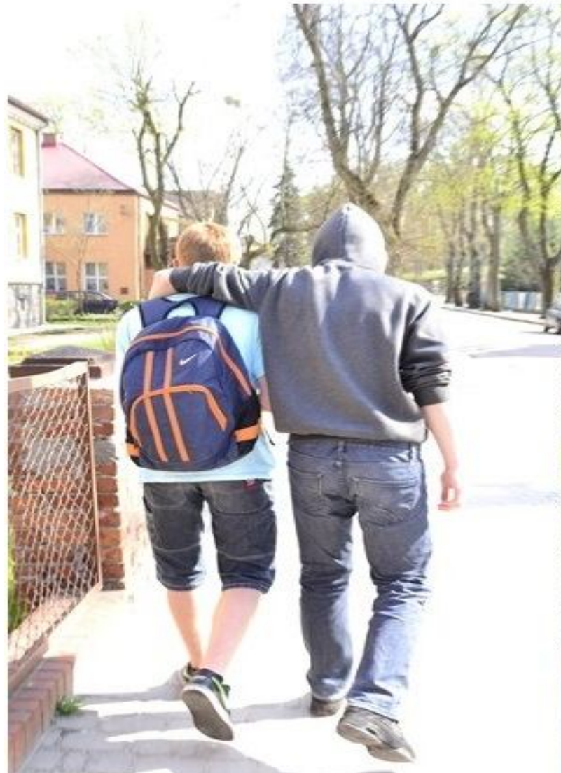
The boys decided to play hooky