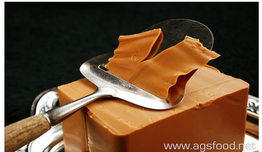
This is browncheese very famous in Norway